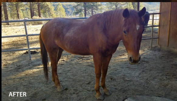
After 6 weeks following King Feeds Weight Gain Program.