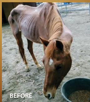
23 year old mare.

After 30-45 days, progress is reviewed and the amount of Dr. Cheek's YQ+ and Ultra 20/20 are adjusted to achieve the desired weight and condition.