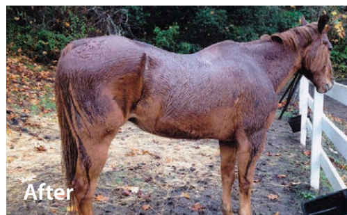
6 weeks following King Feeds Weight Gain Program.