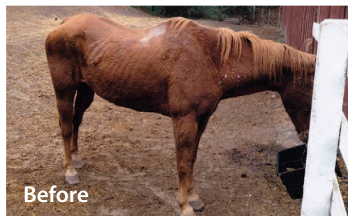
36 year old